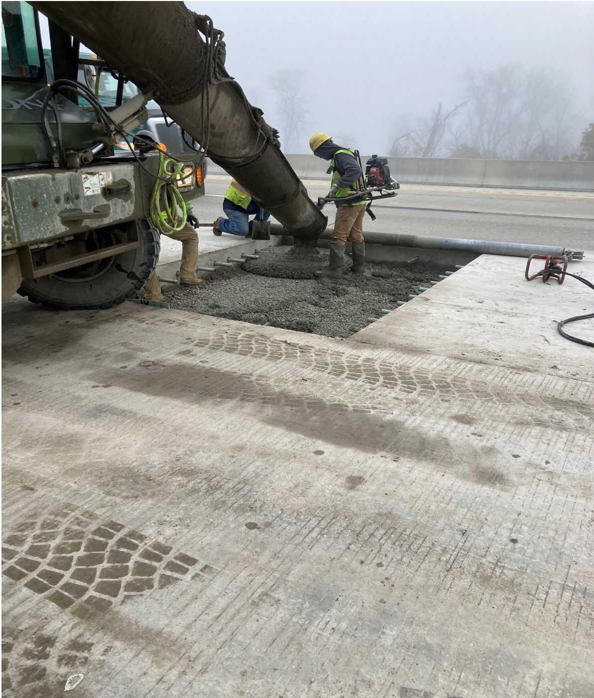
Concrete pavement on I-79 Southbound