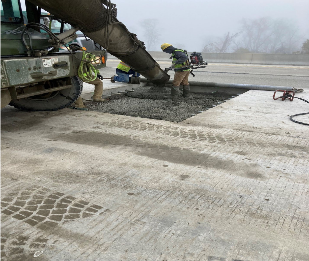
Section: 55C2-1 — Pictured: Concrete pavement on I-79 Southbound

SECTION 55C2-1 TARGET COMPLETION DATE — OCTOBER 2022