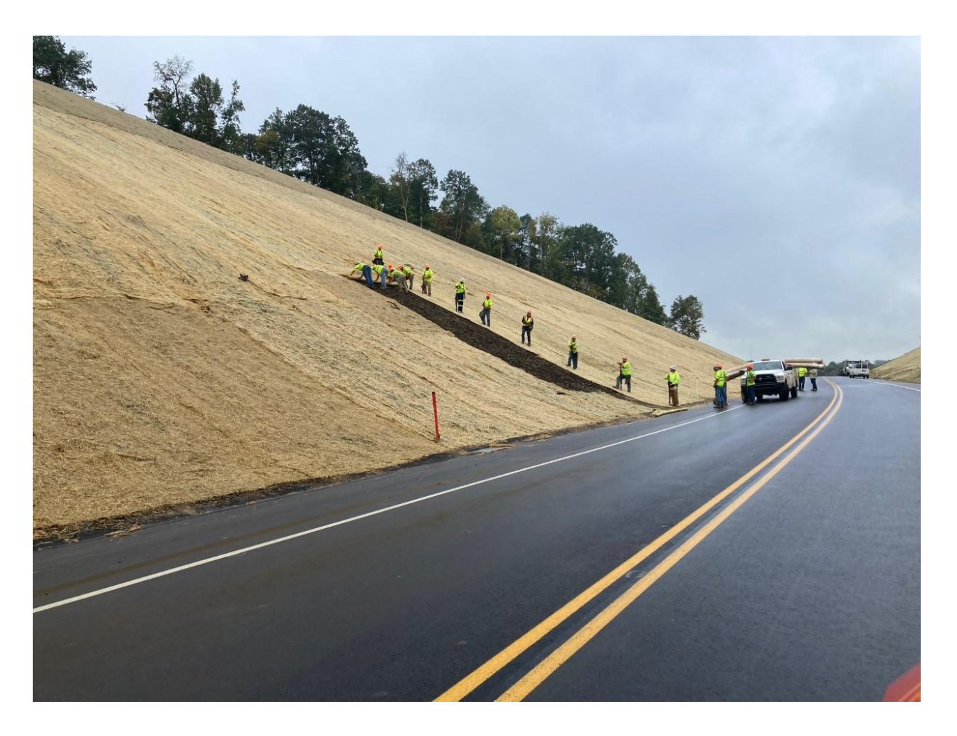
Section: 55A2 — Pictured: Erosion control mulch blanket installation along Fort Cherry Connector cut slope