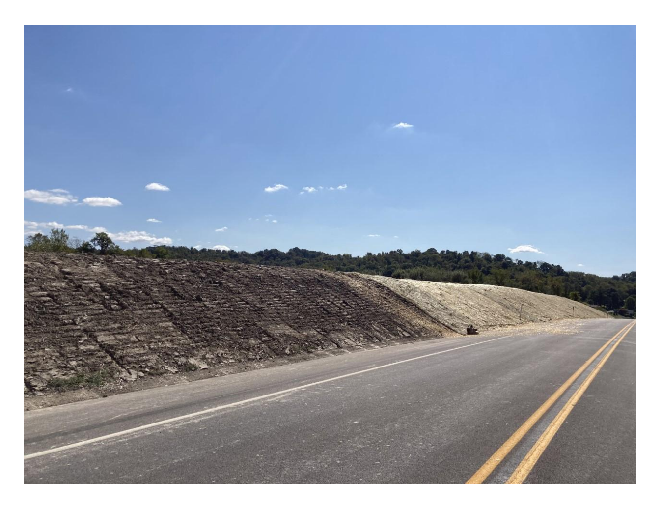
Section: 55A2 — Pictured: Slope erosion control mulch blanket at the Fort Cherry Connector