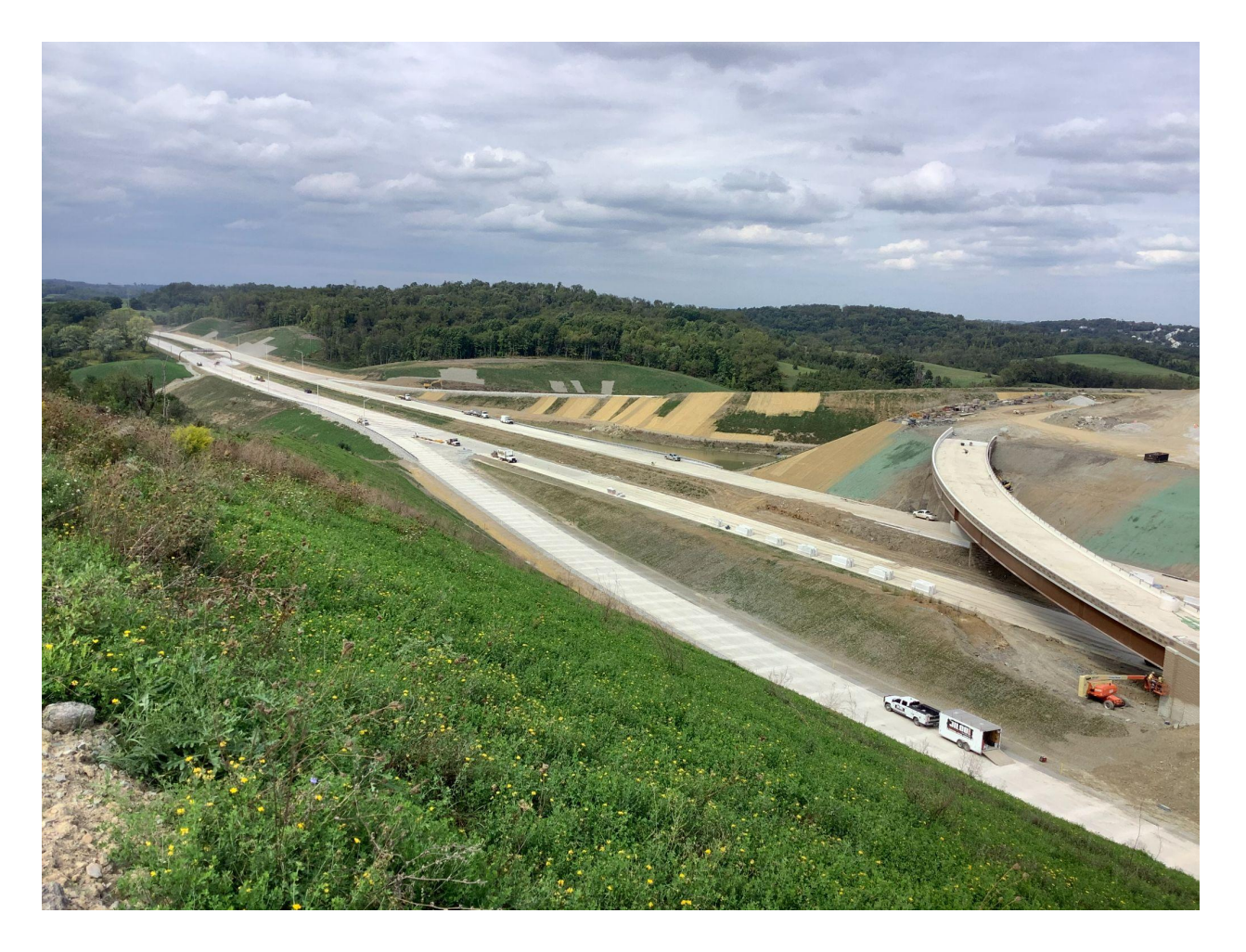
Section: 55C2-1 — Pictured: PA Turnpike 576 overview from County Line Road