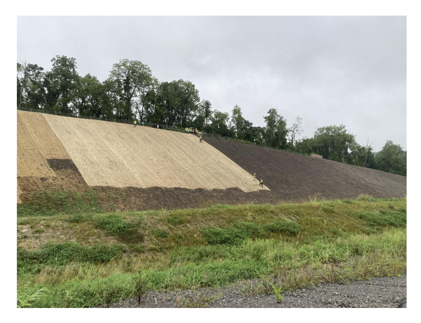
Section: 55A2 — Pictured: Ramp D slope stabilization — erosion control mulch blanket placement