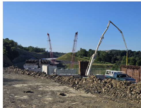
Construction of bridges over New England Road looking south.