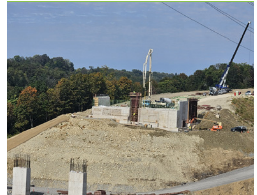
Bridges over Camp Hollow Road construction progress.