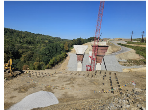
Bridges over Camp Hollow Road construction progress.