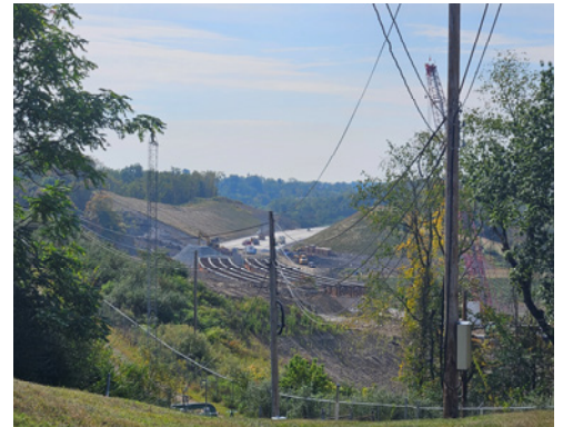
Bridges over New England Road looking south.