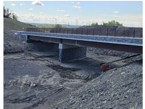
New Camp Hollow Road bridge at future interchange.