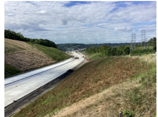
New highway alignment looking north.