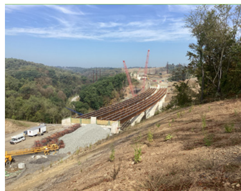
Bridges over Camp Hollow Road construction progress.