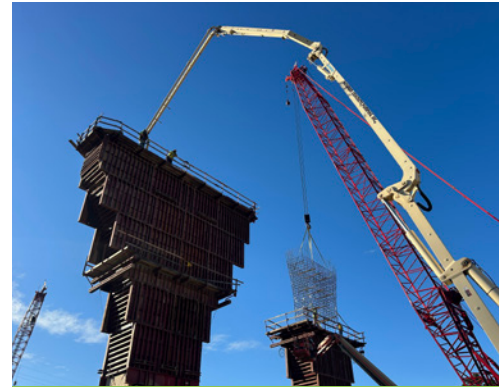
Pier concrete placement - bridge over Camp Hollow Road.