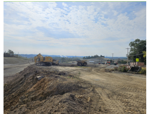
Excavation for new highway near Camp Hollow Road.