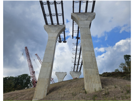
Steel girder installation - bridges over New England Road.