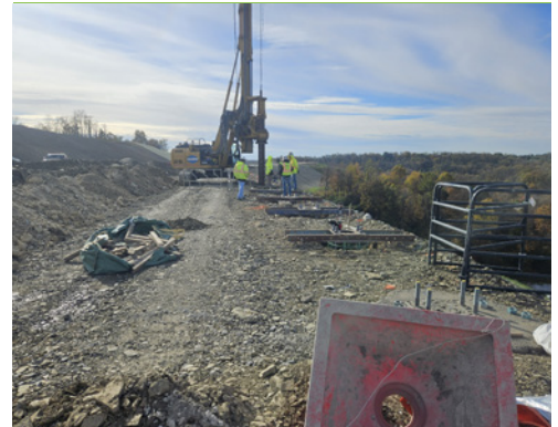
Sound wall foundation construction.