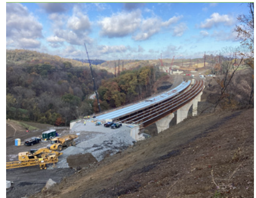
Bridges over New England Road - construction progress.