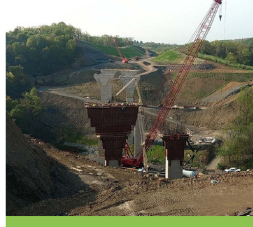
Bridge construction progress for future New England Road bridges.

• <u>Lower Camp Hollow</u> – Opened to thru traffic. Construction traffic will continue crossing utilizing flaggers while bridge construction is underway. This section of Lower Camp Hollow will be closed in the future to continue the rock slope work where the bridges cross.