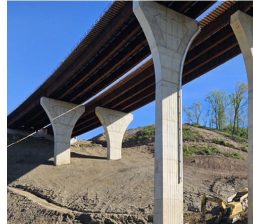
Bridge over New England Road - north slope grading.

Learn more about the Mon/Fayette Expressway by visiting the project website.