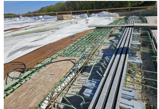
Expansion dam installation for bridge over New England Road.