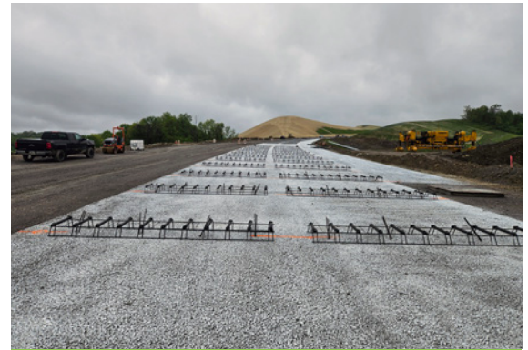
New highway ready for concrete paving.