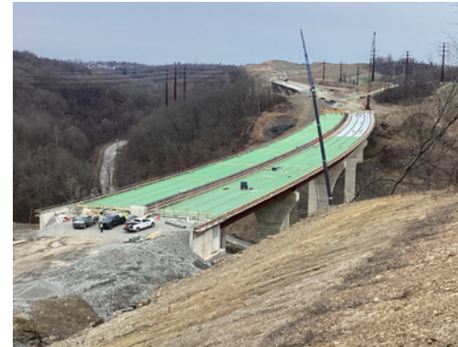
Bridges over New England Road - construction progress.