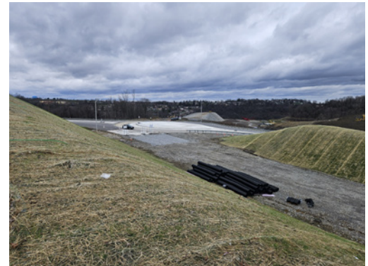
Camp Hollow Road north roundabout and future highway on ramp.