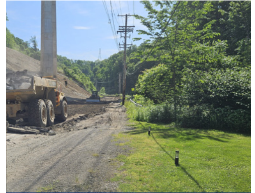
New England Road reconstruction under new bridges.