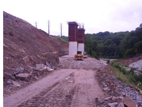
Coal Valley Road bridges construction progress.