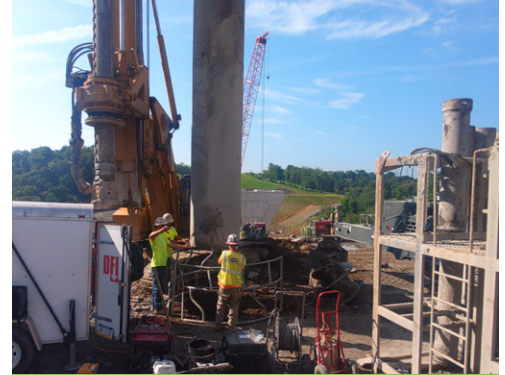
Drilled caisson installation for bridges over New England Road.