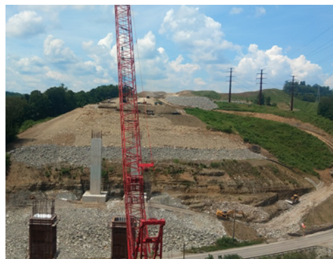
Construction progress for bridges over Camp Hollow Road.