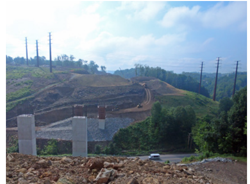
Camp Hollow Road bridges construction progress.

Learn more about the Mon/Fayette Expressway by visiting the project website.