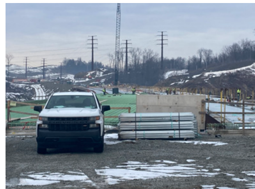
Bridges over New England Road - deck construction.