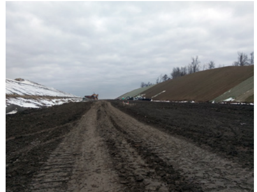
PTC 43 new highway alignment.