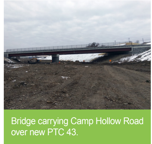
Bridge carrying Camp Hollow Road over new PTC 43.