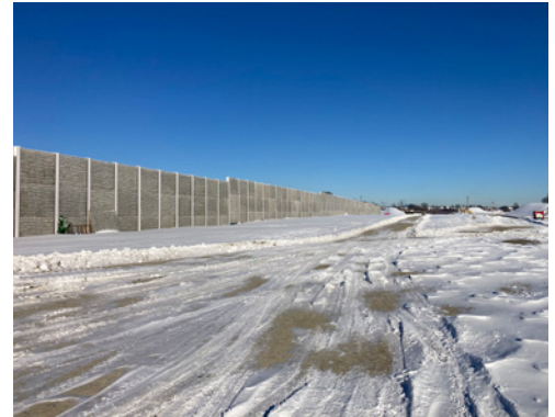
Sound wall construction progress.