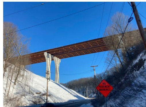
Bridges over Camp Hollow Road - steel girders installed.