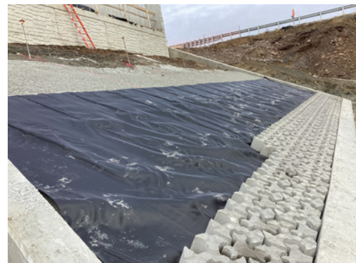
Bridge carrying Camp Hollow Road - articulating block slope wall construction.