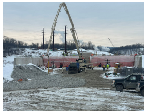
Bridges over Camp Hollow Road - backwall concrete placement.