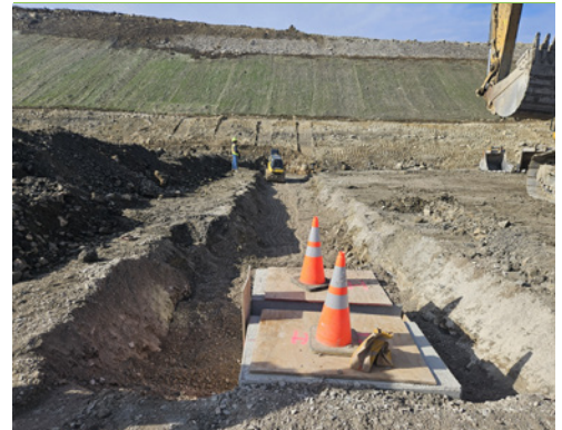
Drainage installation for new highway.