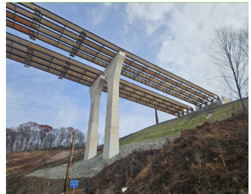
Bridges over Camp Hollow Road - steel girders installed.