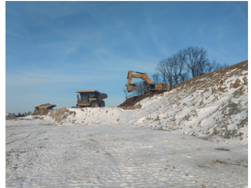
Roadway excavation continuing through winter.