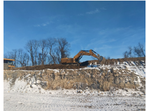
Project bulk excavation near complete.