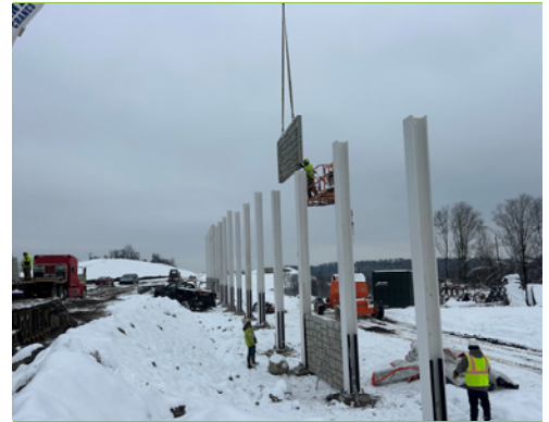
Sound wall panel installation.