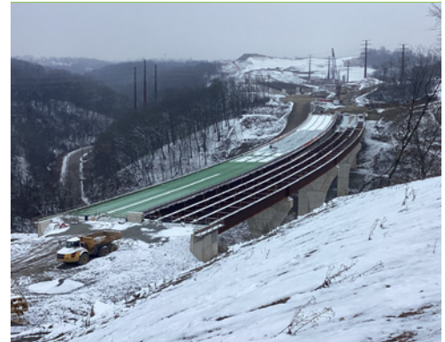
Bridges over New England Road - construction progress.