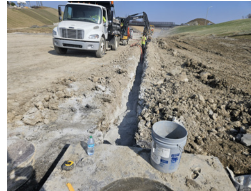
Intelligent transportation system micro duct installation.