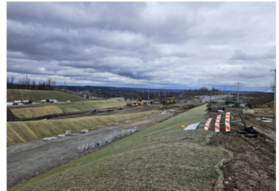
Camp Hollow Interchange southbound on ramp and new highway alignment.