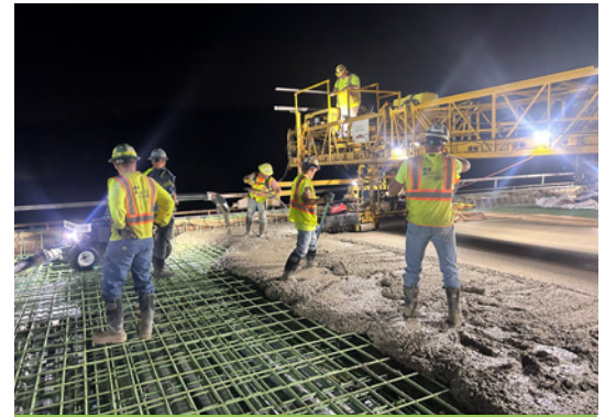
Bridges over New England Road - concrete deck placement.