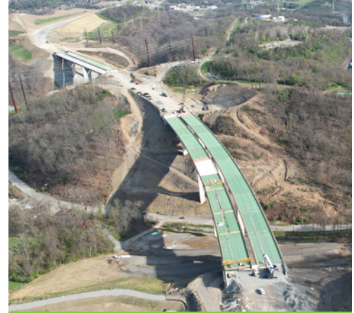
Bridges over New England Road - construction progress.

Learn more about the Mon/Fayette Expressway by visiting the project website.