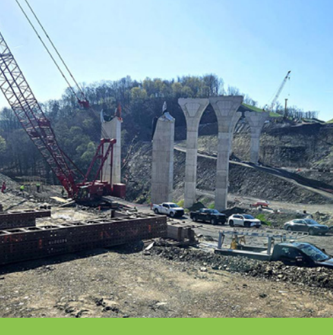
Construction progress on bridges over New England Road.