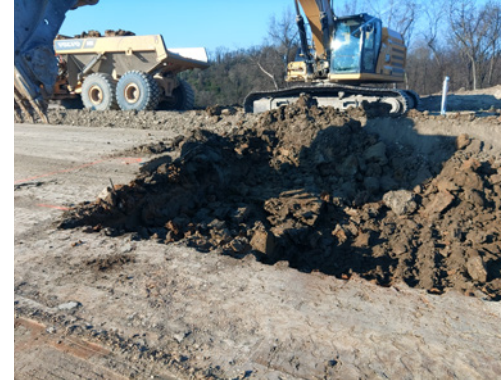
Subgrade preparation for new highway.