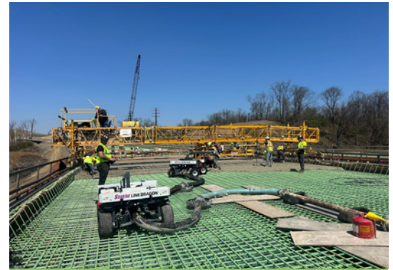
Bridges over New England Road - concrete deck placement.