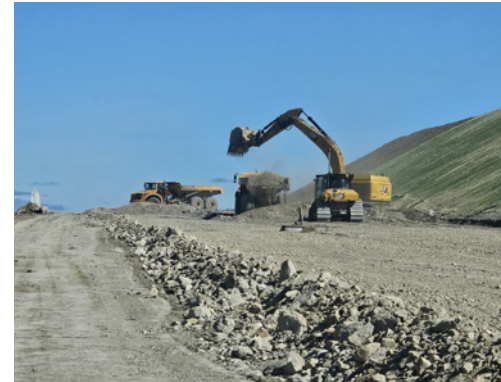
Rough grading new highway alignment.

Learn more about the Mon/Fayette Expressway by visiting the project website.