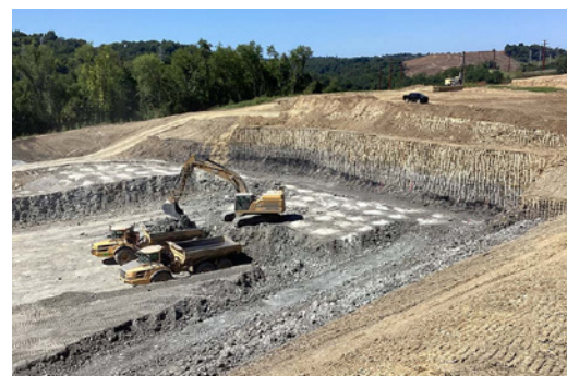
Excavation occurs between Coal Valley Road and New England Road.