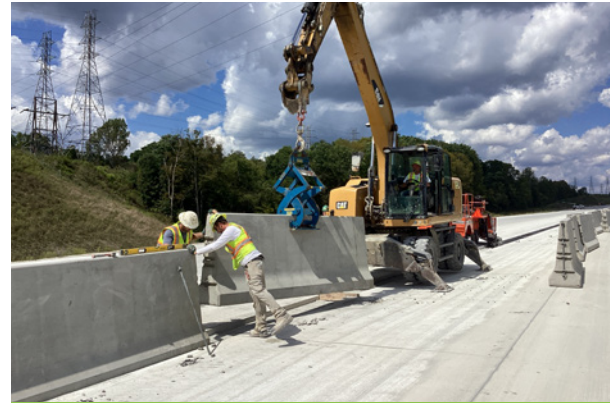
Median barrier installation.