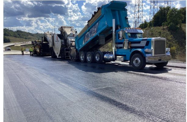
Bridge approach asphalt paving.