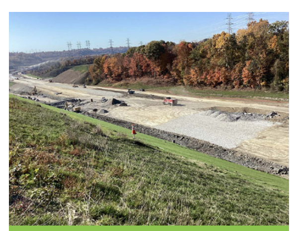
Construction progress near Jeffferson Boulevard.