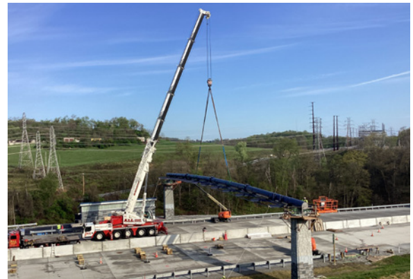
Over the road tolling gantry erection.