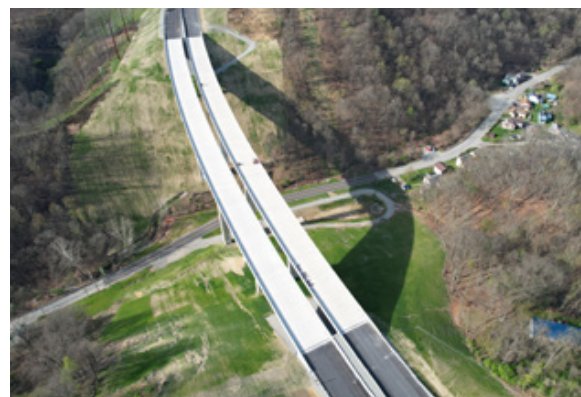
Bridges Over Coal Valley Road.