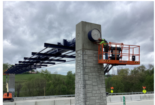
Over the road tolling gantry installation.