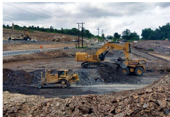
Excavation continues near SR 885.