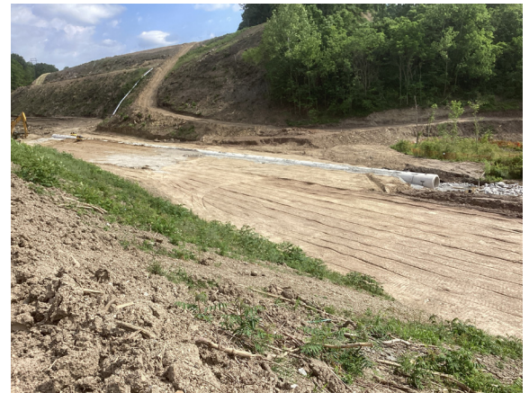
60 inch Reinforced Concrete Pipe Installation.