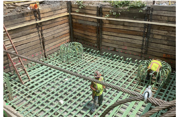
Contractors work on the Pier 2 foundation for the bridge over SR 51.