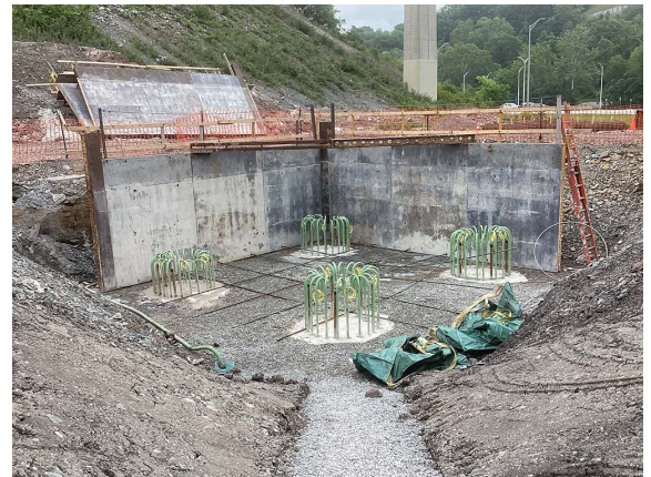
A top view of drilled concrete caisson pier foundations for one of the bridges over S.R. 51.