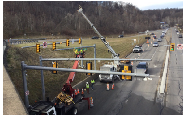
SR 51 and Jefferson Boulevard traffic signal work.