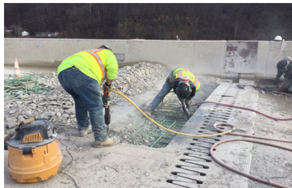
Existing Jefferson Boulevard ramp bridge expansion dam rehabilitation.