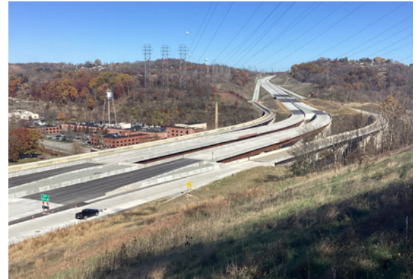
Bridges over SR 51.