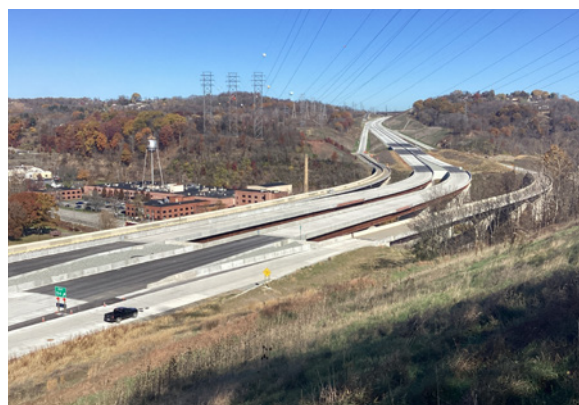
Bridges over SR51.