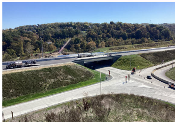
Jefferson Boulevard interchange.