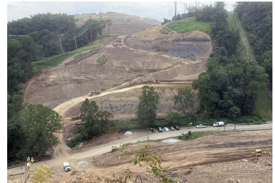
Future bridge crossing at Coal Valley Road