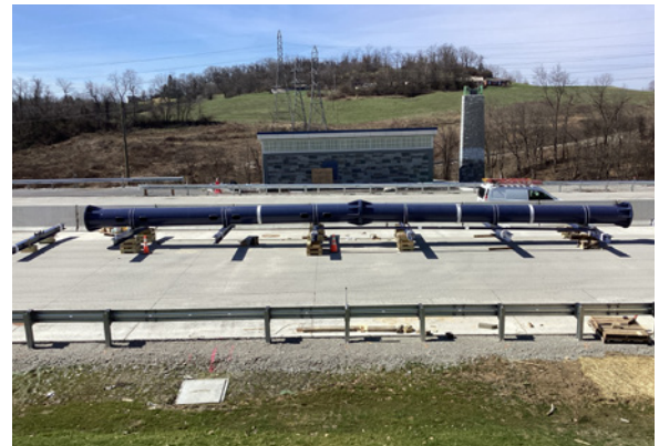
Over the road tolling facility - construction progress.